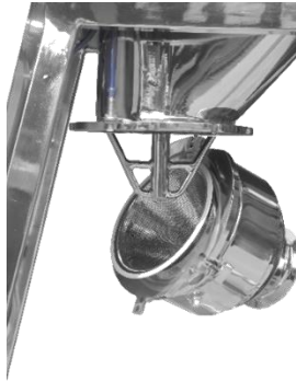
Co Mill Impeller