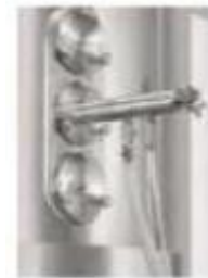
3 Level Spray Nozzle Entry

Suitable for Top Spraying Double Skin AHU with Pre, Micro, & Hepa Filter Steam Coil & Chilled Coil Spark Proof exhaust blower Three level inflatable seal Three level Pneumatic cylinder 2 Bar Design 21 CFR Part 11 Compliance